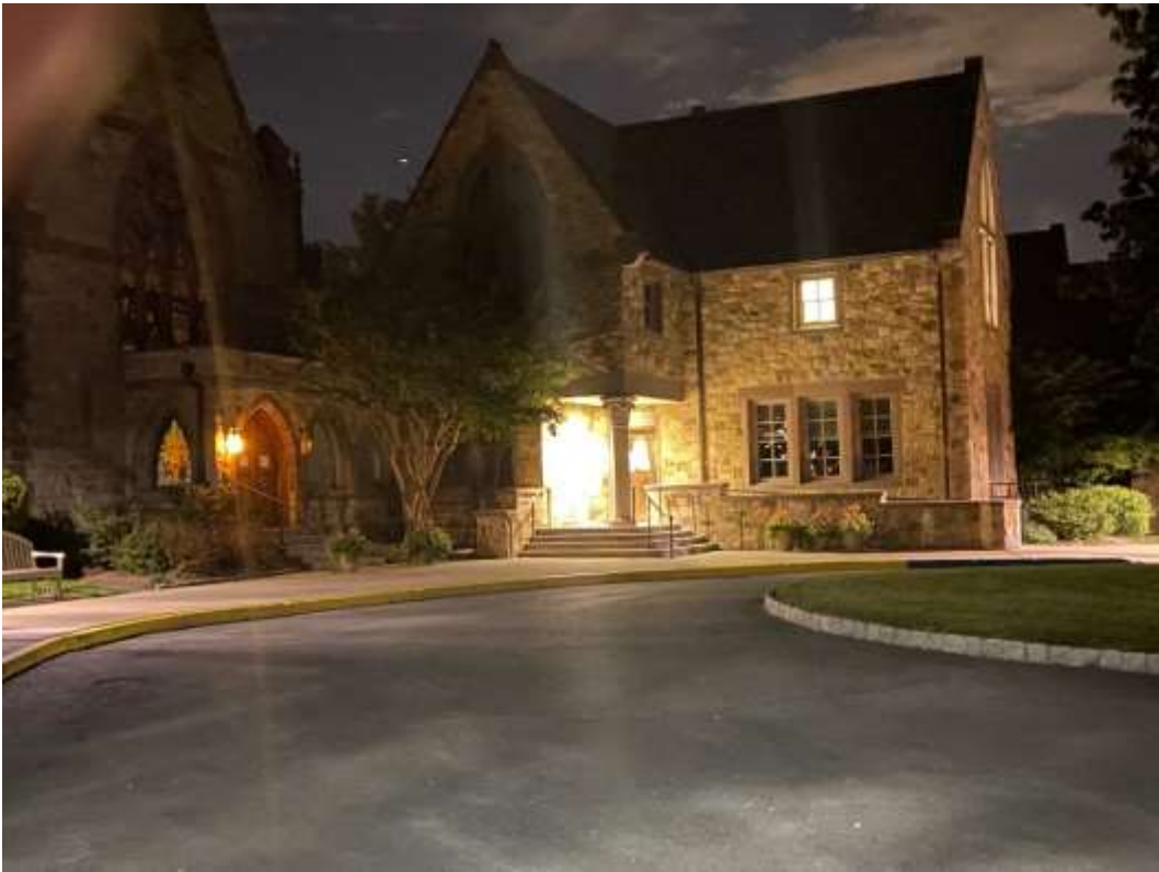
This view is the door (the one that is brightly lit, straight ahead) for the meeting entrance