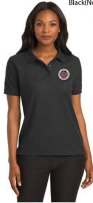
L500 Port Authority® Ladies Silk Touch™ Polo Black(Non Fill logo) (S-XL)-$30.10 (2XL)-32.10 (3XL)-33.10