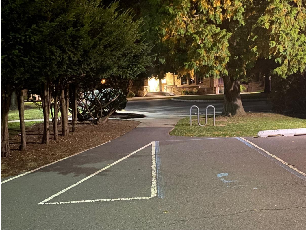
This view is in the parking lot facing toward the meeting entrance door.