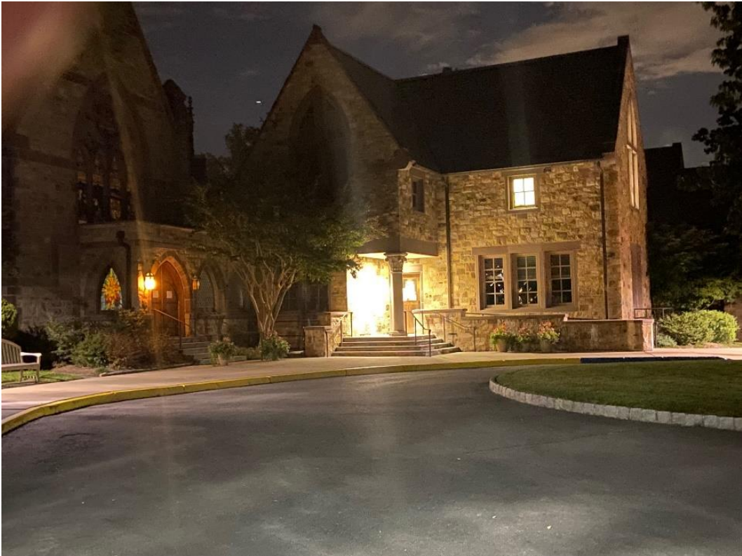
This view is the door (the one that is brightly lit, straight ahead) for the meeting entrance