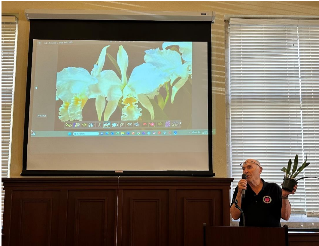
C. mossiae v. alba