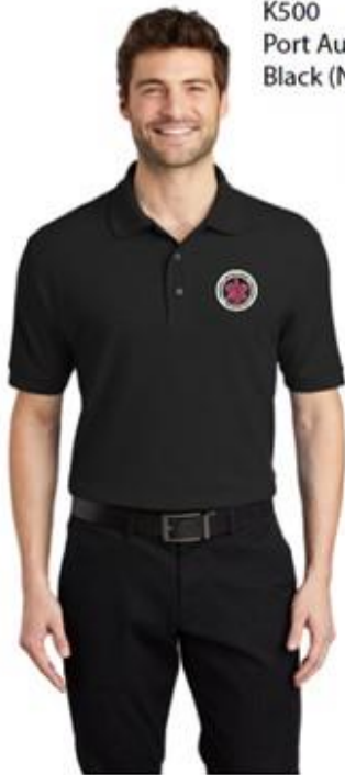
K500 Port Authority® Silk Touch™ Polo Black (Non Fill Logo) (S-XL)-$30.10 (2XL)-32.10 (3XL)-33.10