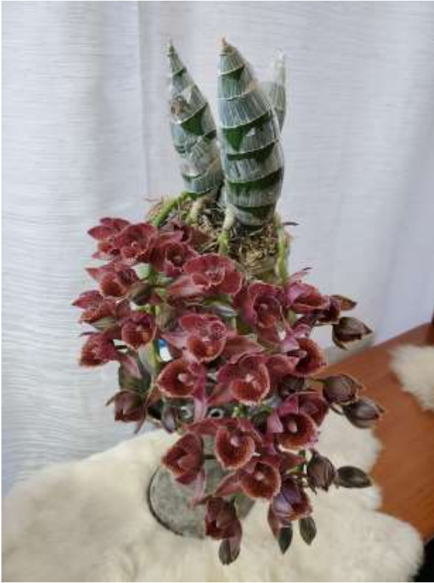
Cl Grace Dunn 'Live Oak' x Morm. ignea 'Orange Blaze'