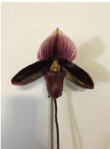
Paph Delightfully Constrasting