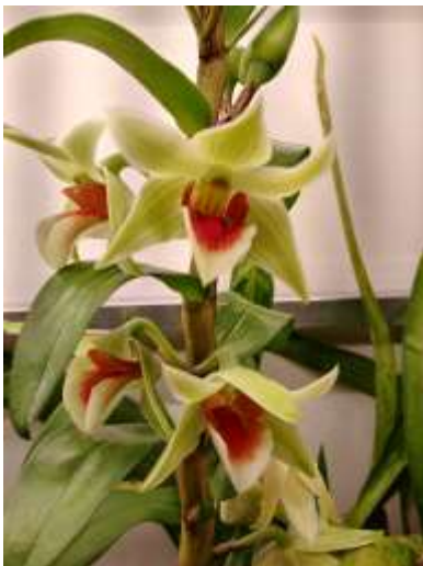
Den. Frosty Dawn x Pang Seng