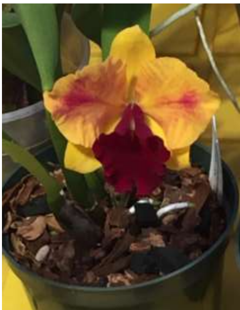
Rhyncholaeliocattleya Murtha's Luck