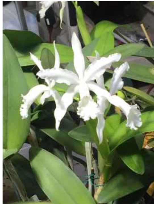
C Intermedia x C Warneri