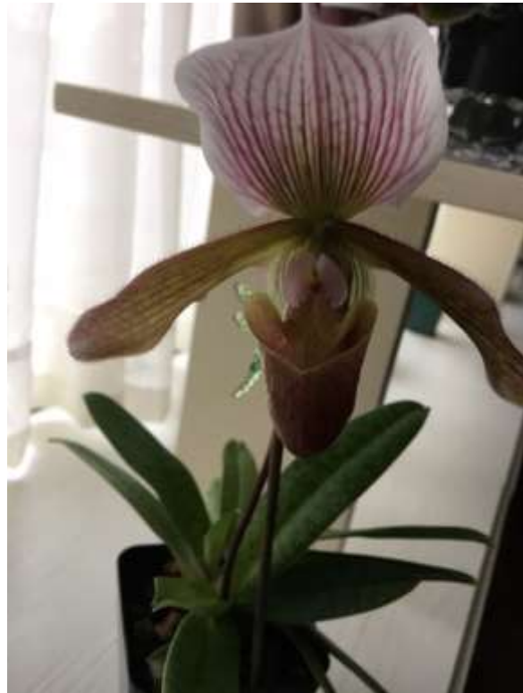
Paph Jewel Pink (Egret Jewel 'Blond Gem' x charlesworthii fma sandowiae 'Big Beauty')