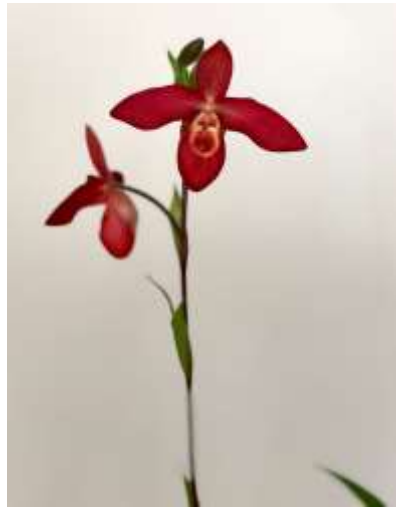
Phrag Rouge Boullion (Mem. DC 'Rocket Flash' 4n x daless)