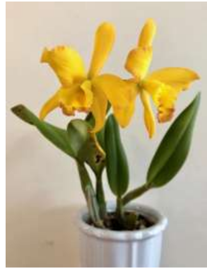
Blc Love Sound 'Dogashima' x Blc Guess What 'SVO'