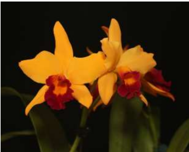
Blc Orange Magic (Lc Tokyo Magic x Blc Orange Nugget)