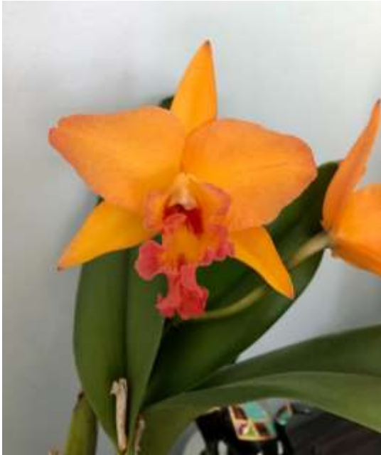
Pot Love Passion 'Dogashisma' x Blc Hawaiian Discovery 'Flourescent Orange'