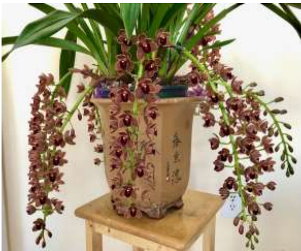
Cym Dorothy Stockstill 'forgotten fruit'