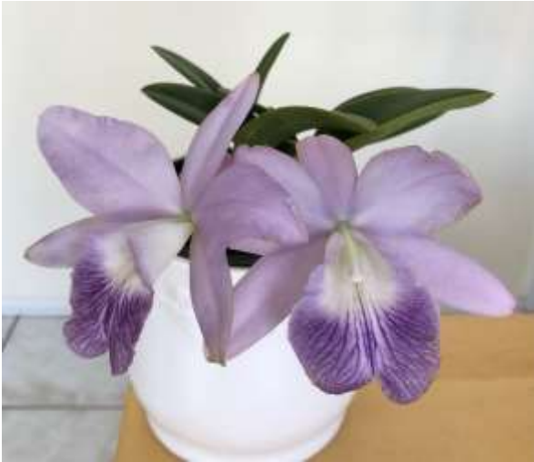
Lc. Love Knot 'Blue Moon'