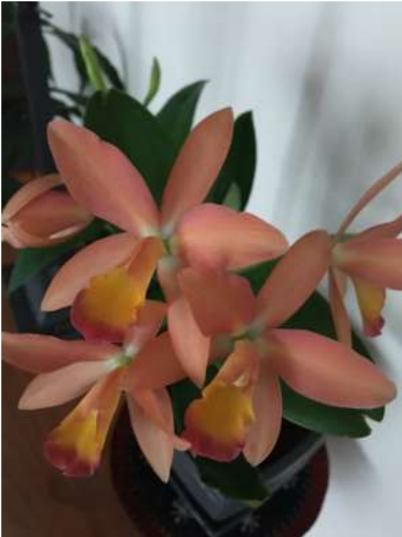
C. Caribbean 'Orange Bowl' (Margaret Stewart C. auraniaca)