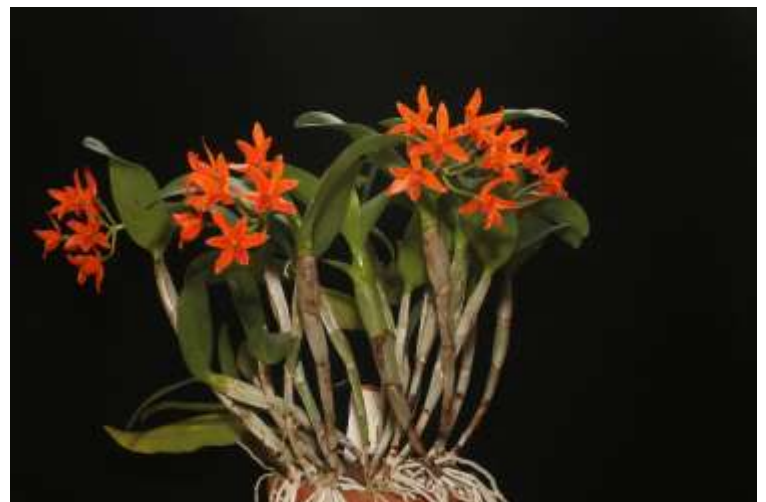
C. (Gur) aurantiaca ('Mishima Spot' 'SVO Spots #2')