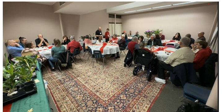
CJOS Holiday Party