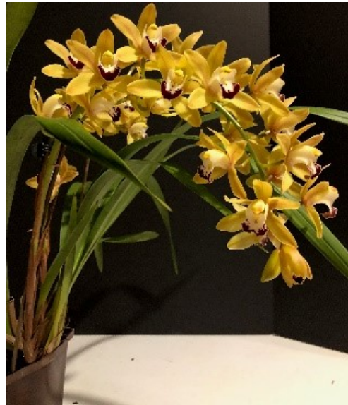
1. Cym Ming Emperor: Luanne Arico