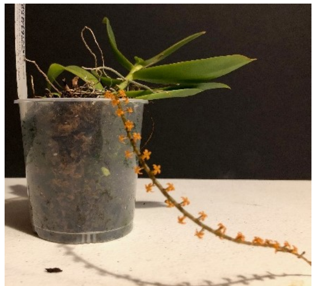
3. Microterangis hariotiana : Renee Jolley